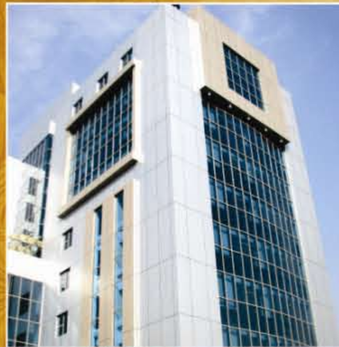
EMIGRATION TOWER, ISLAMABAD