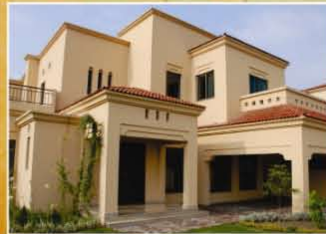
ZAAMIN LAKE CITY VILLAS, LAHORE