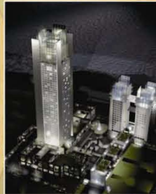
GRAND HYATT, ISLAMABAD