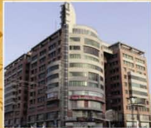
CITY TOWERS, LAHORE