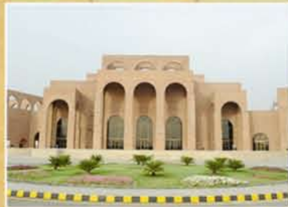
EXPO CENTER, LAHORE