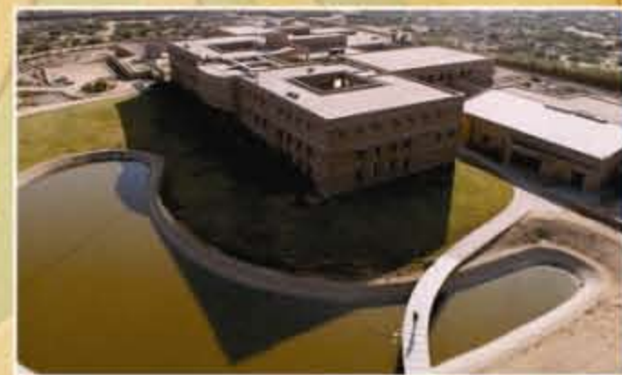
TEXTILE INSTITUTE, KARACHI