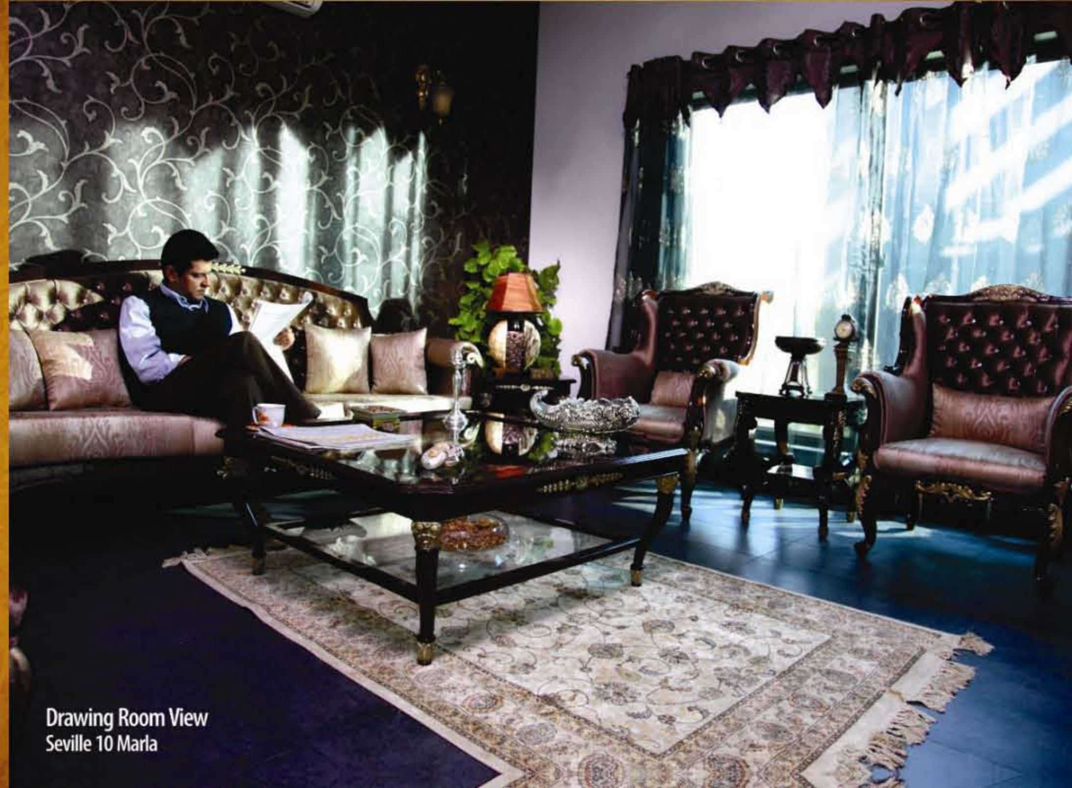
Drawing Room View Seville 10 Marla